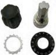
MA-016768-001 Channel Knob Kit